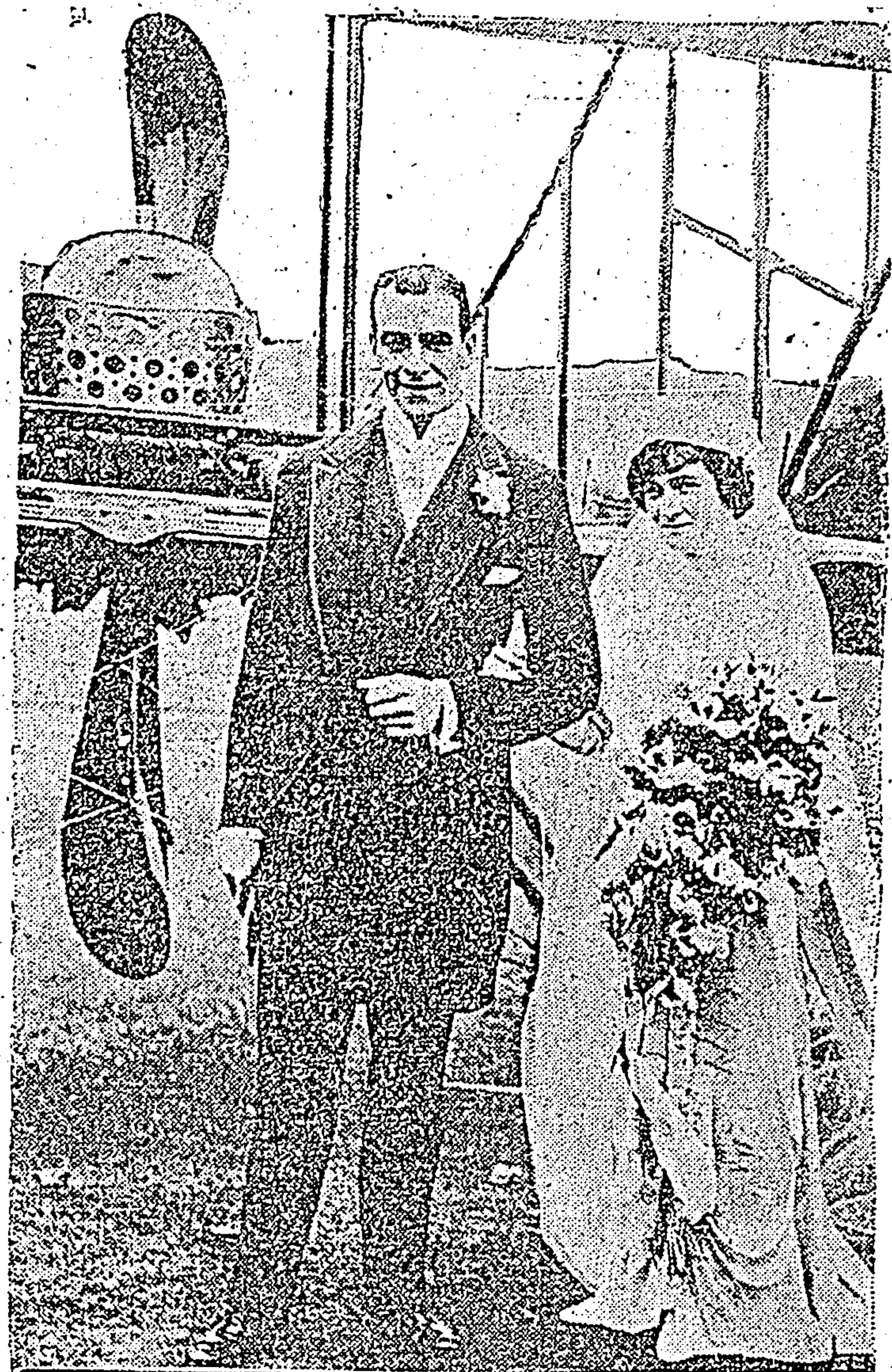
GRAHAME-WHITE AND HIS BRIDE